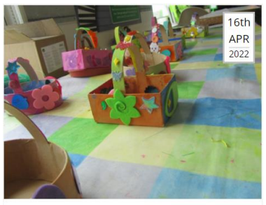
Easter Basket Making Session

https://masandpas.com/easter-egg-hunt-clues-free-printables/